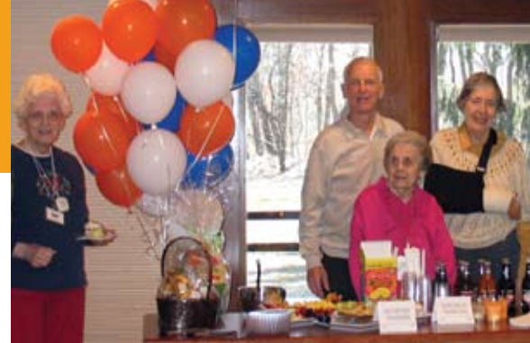
Current and future residents experienced the strong community spirit that permeates our campus during the Celebration of Yesteryear event.