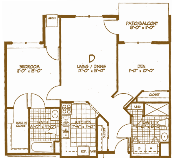
OPTION D ONE BEDROOM, ONE DEN, TWO BATHS